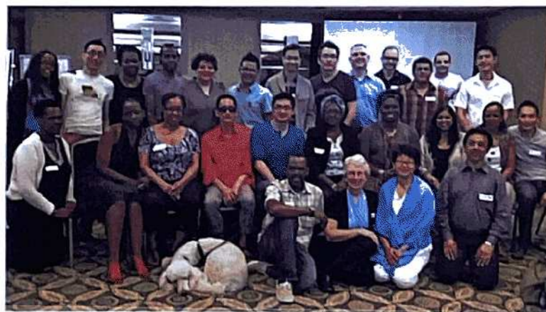
CAAT Research Think Tank.

The CAAT research think tank on HIV and Immigration was held on May 29th in Toronto and attracted over 40 participants from health, legal, policy, HIV, social service, academic institutions, and people living with HIV/AIDS from across the GTA. The objectives of the research think tank were to share current knowledge and identify evidence gaps and research priorities among newcomer communities, and to facilitate community-campus partnership development to address these gaps.